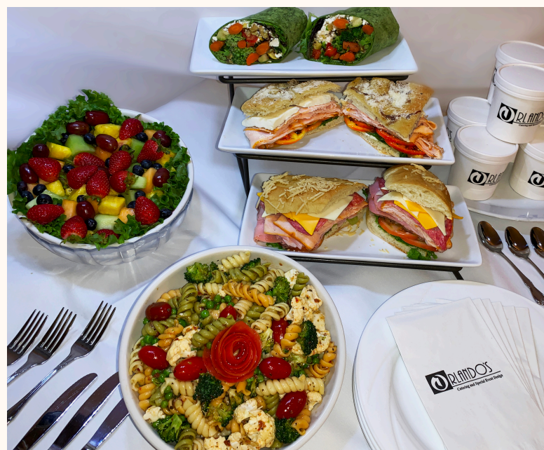
Picture is an example of service with soup added - all items come on black round disposable trays & clear bowls

For heartier appetites consider adding one of our soups!